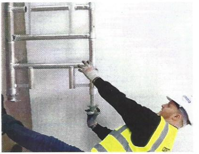
Insert 2 adjustable legs into each of the portal frames