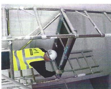
Fit a platform to the 2nd rung of the 4 rung plain frame with the trapdoor on the ladder frame side.