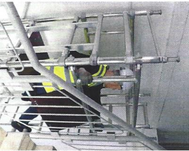
Sitting through the platform, fit 2 guardrail frames, one either side or 4 Horizontal braces 2 either side with hooks facing out. Ensure hooks are fully engaged.