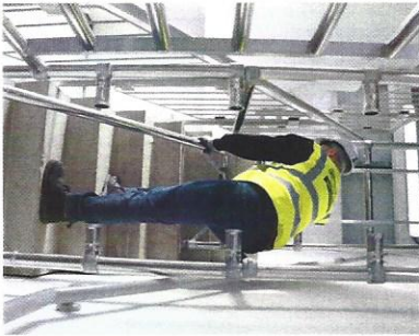
Fit diagonal brace from bottom rung of ladder portal frame to bottom rung of plain portal frame, on the left hand side.