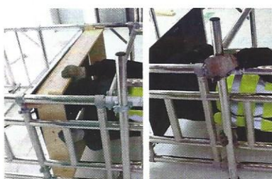
Fit 2 side props every 2m, one at each end of the tower. If you cannot props, stabilizers shall be fitted at 4 corners of the tower. They shall be fitted to create the largest footprint possible. Then fit your toe-boards. Dismantling is the reverse of assembly