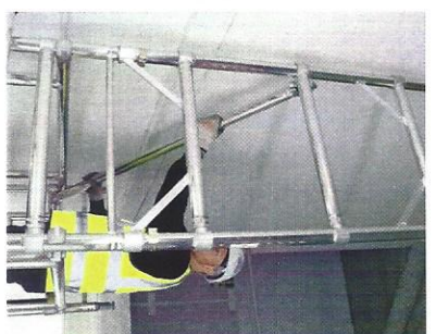
Fit a diagonal brace from the 2nd rung above the platform to the second rung of the 4 rung plain frame.