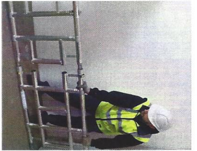
Fit the offset ladder frame* on to the ladder portal frame & position the frame down the stairs.