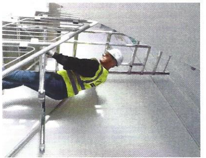
Position the plain portal at the top of your stairs then fit the horizontal braces above the 1st rung.