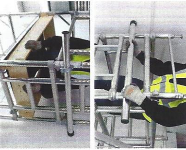
Fit a side prop to the top of each frame, one either end of the tower and then fit your Toe-boards to the tower. Dismantling is the reverse of assembly