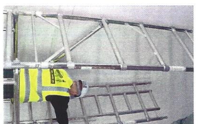
Fit a plain 4 rung frame to the tower ladder portal frame and engage interlock clips.