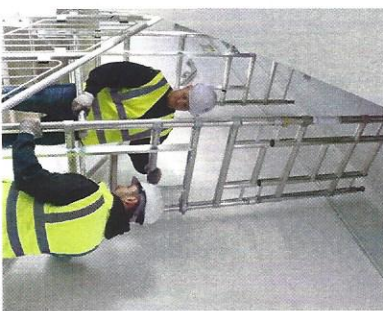
Position the ladder portal at the bottom of your stairs and connect the horizontal braces above the 3rd rung. Level the tower by adjusting the legs.