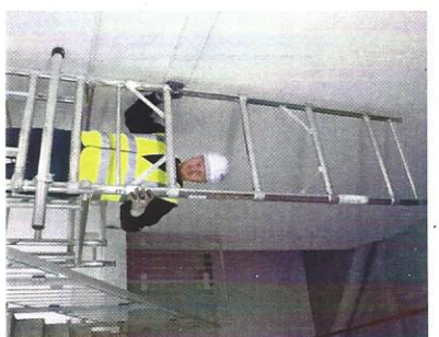
Fit a plain 4 rung frame to the plain portal frame and engage the interlock clips.