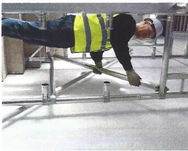
Fit another diagonal from the bottom rung of the plain portal frame to the top rung of ladder portal frame on the right hand side.