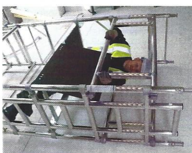
Sitting through the platform, fit 2 guardrail frames, one either side or 4 Horizontal braces 2 either side with hooks facing out. Repeat steps 1 - 5 to build additional heights. Ensure hooks are fully engaged.