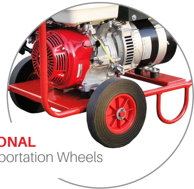
OPTIONAL Transportation Wheels